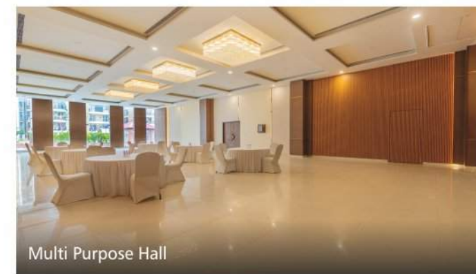
Multi Purpose Hall