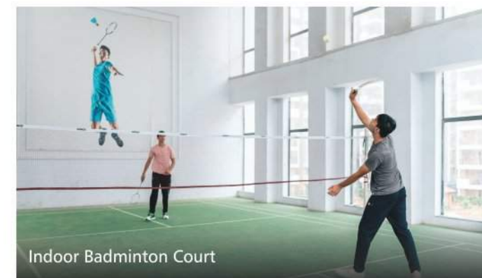
Indoor Badminton Court